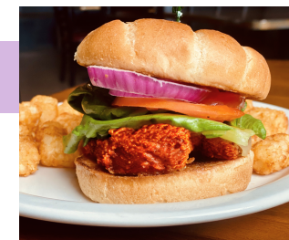
BUFFALO CHICKEN SANDWICH