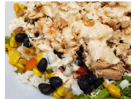
BUILD-YOUR-OWN FIESTA RICE BOWL

Teriyaki, garlic parm, honey BBQ, Korean BBQ, sweet chili, buffalo, mango habanero, honey garlic hot, Jamaican Jerk, habanero hot