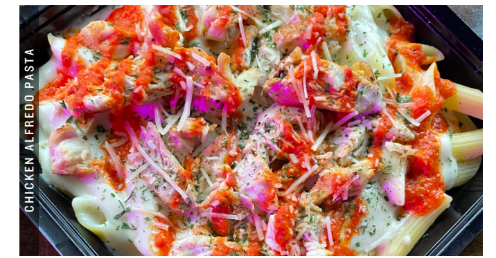
CHICKEN ALFREDO PASTA

Lettuce, black olives, cucumbers, fiesta corn, green peppers, red peppers, jalapenos, mushrooms, onions, pineapple, pickles, banana peppers, spinach, tomato