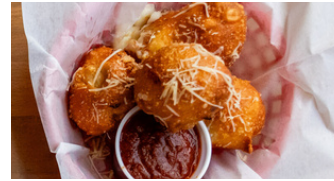
BACK ALLEY POPPERS