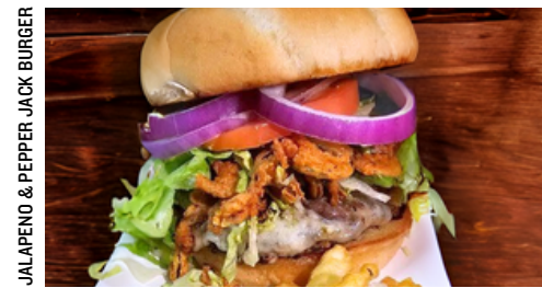
JALAPENO & PEPPER JACK BURGER

All burgers and sandwiches are served with your choice of side & dressing. Add avocado for just $1.00!