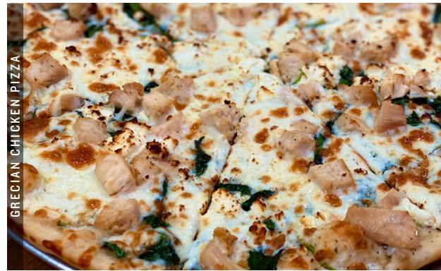
GRECIAN CHICKEN PIZZA

Choice of grilled or fried chicken topped with mozzarella and drizzled with buffalo sauce & ranch