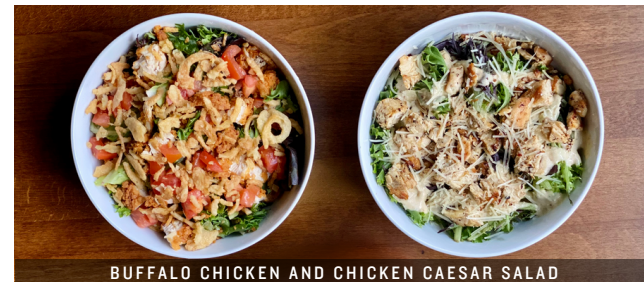
BUFFALO CHICKEN AND CHICKEN CAESAR SALAD

A classic flatbread made with house made red sauce, fresh mozzarella, roma tomatoes and fresh basil